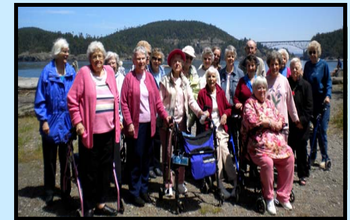
Deception Pass June 2010